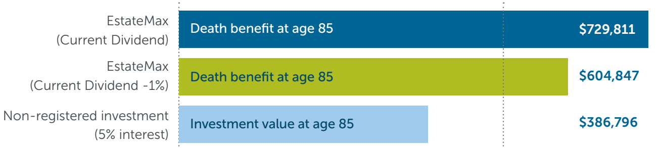
Illustration is based on an interpretation of current tax law; and does not constitute legal or tax advice for a specific individual. The differences in an individual's circumstances may have an impact on the effect of the tax treatment being shown.